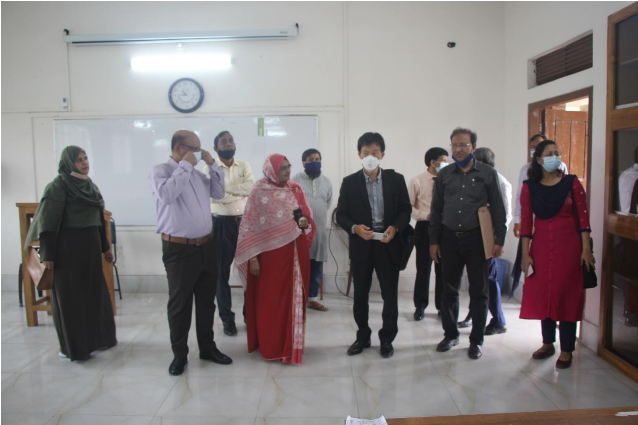
College Visit by CEDP & World Bank