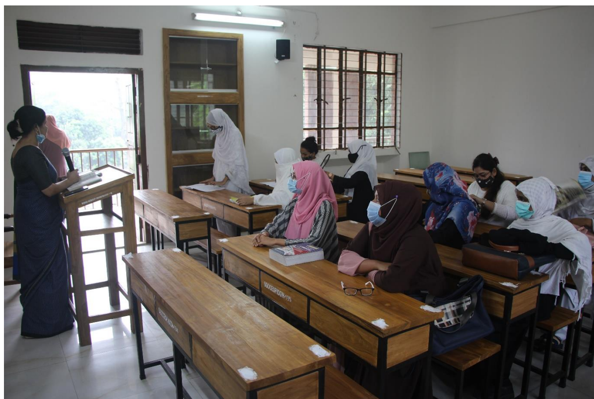
Refurbishment of Classroom by IDG Sub-Project