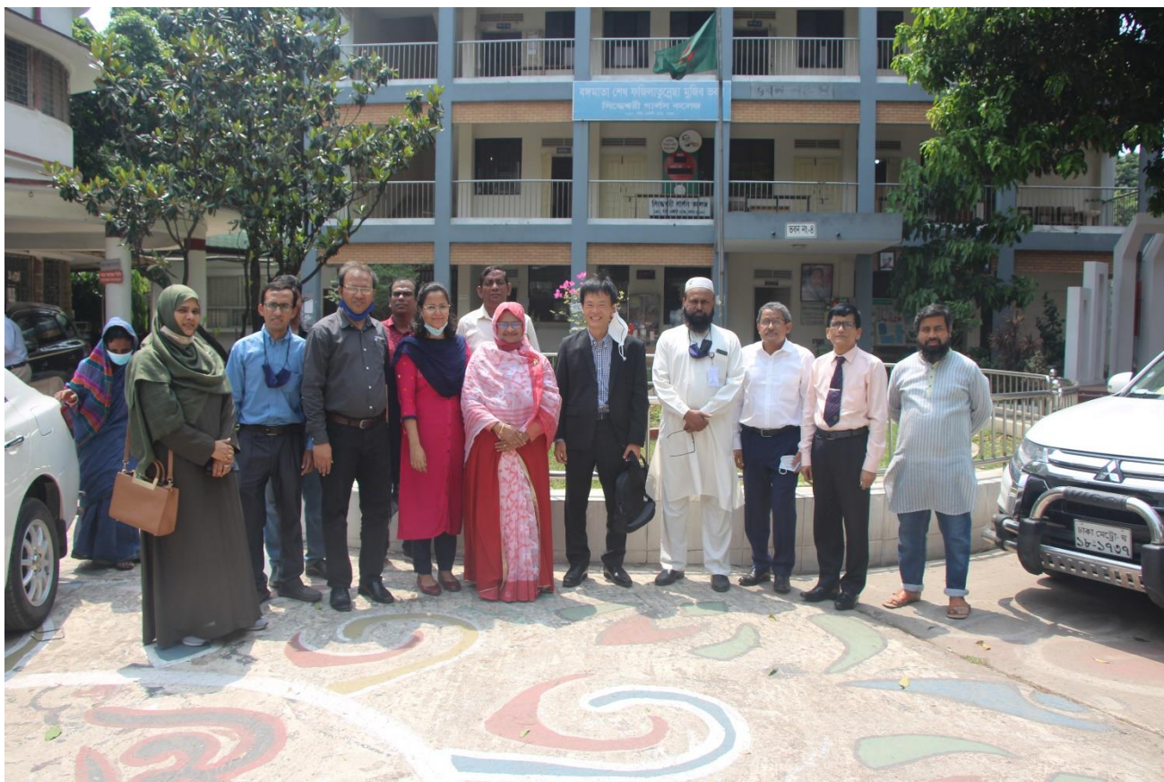
College Visit by CEDP & World Bank