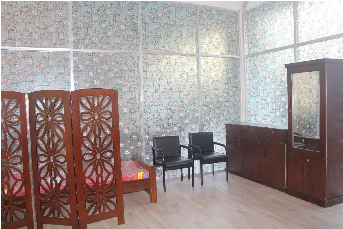
Mother Care Corner in Side by IDG Sub-Project