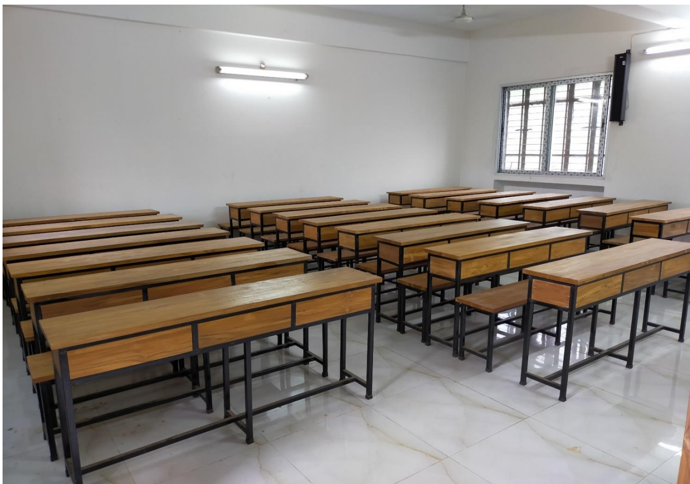
G-4 (High Bench & Low Bench) by IDG Sub-Project