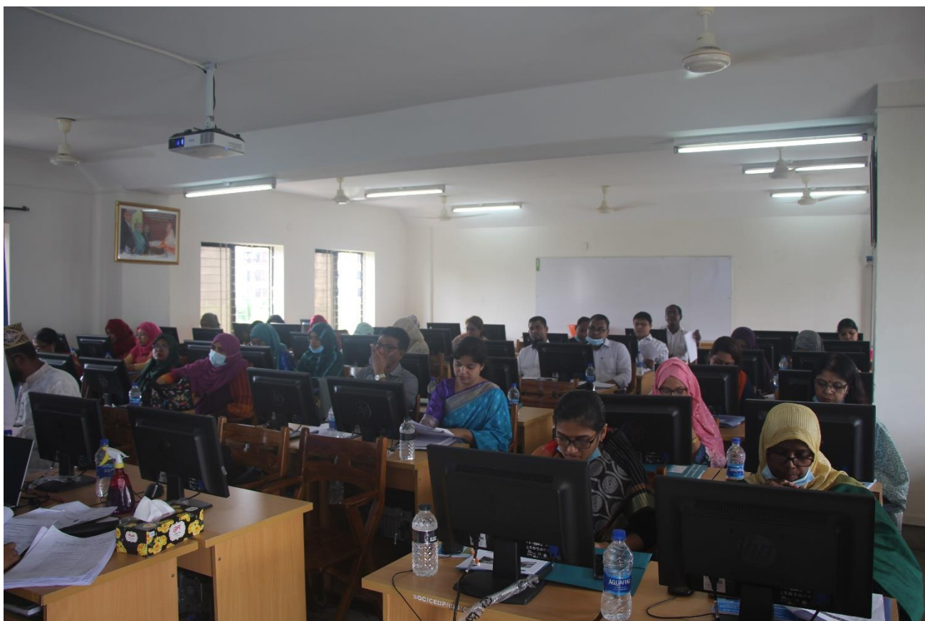
ICT Training by IDG Sub-Project