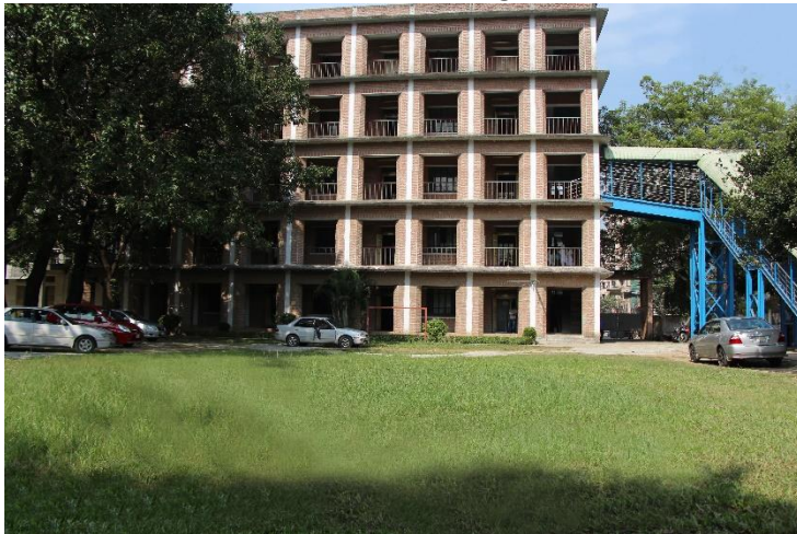
Academic Building 9