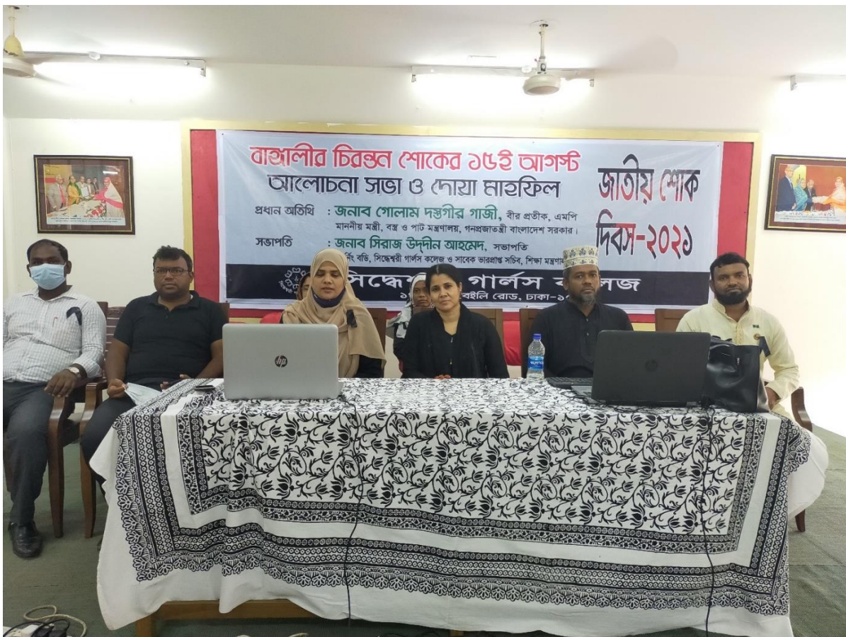
Observing 15 th August-2021