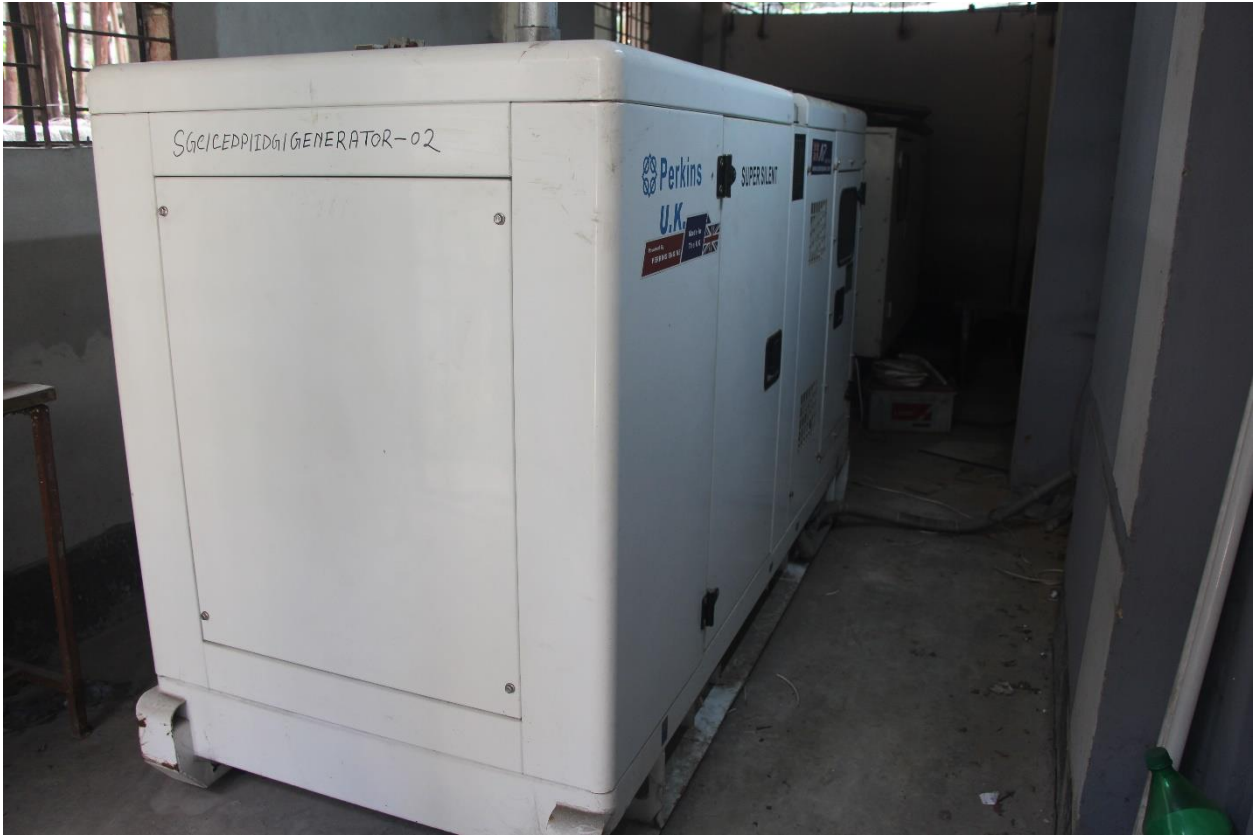
Generator Installation by IDG Sub-Project