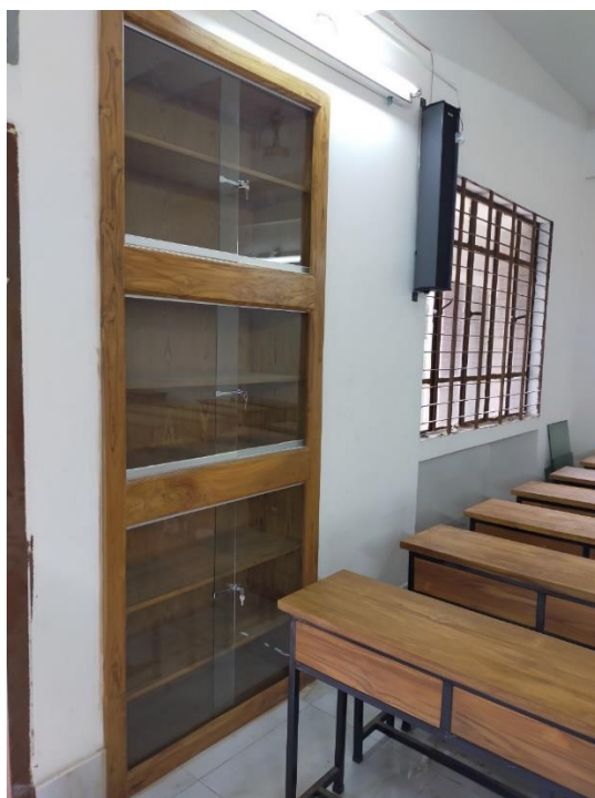
Renovation work under CEDP sub-Project by IDG Sub-Project