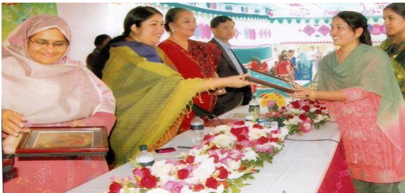
Merit Award Ceremony-2012