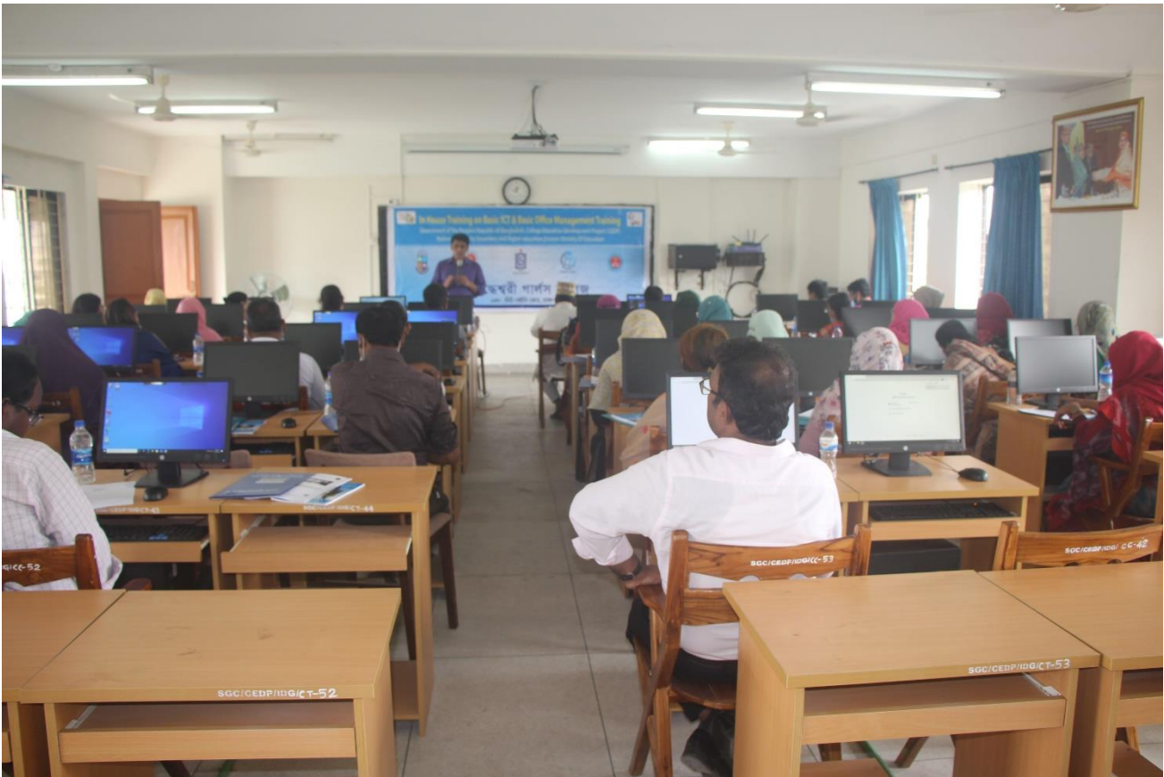
ICT Training by IDG Sub-Project