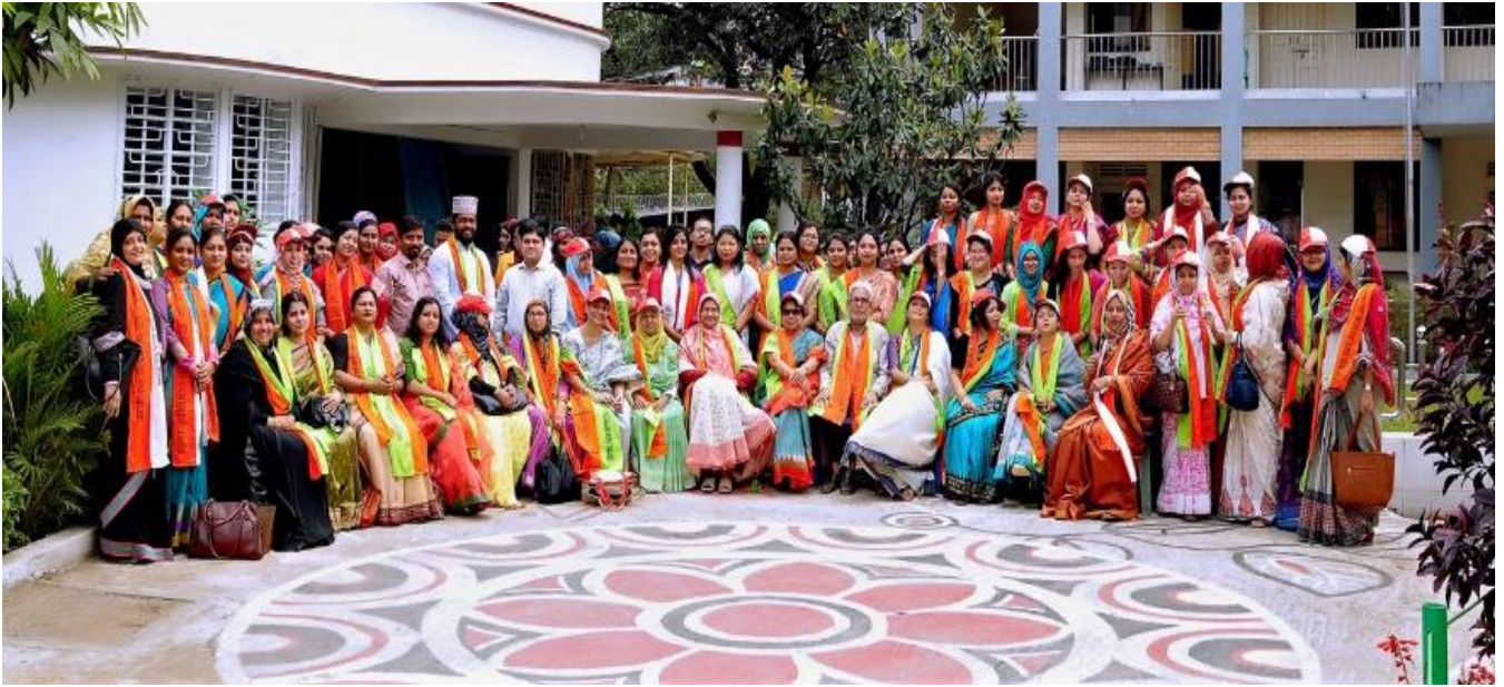
Teachers with the Principal