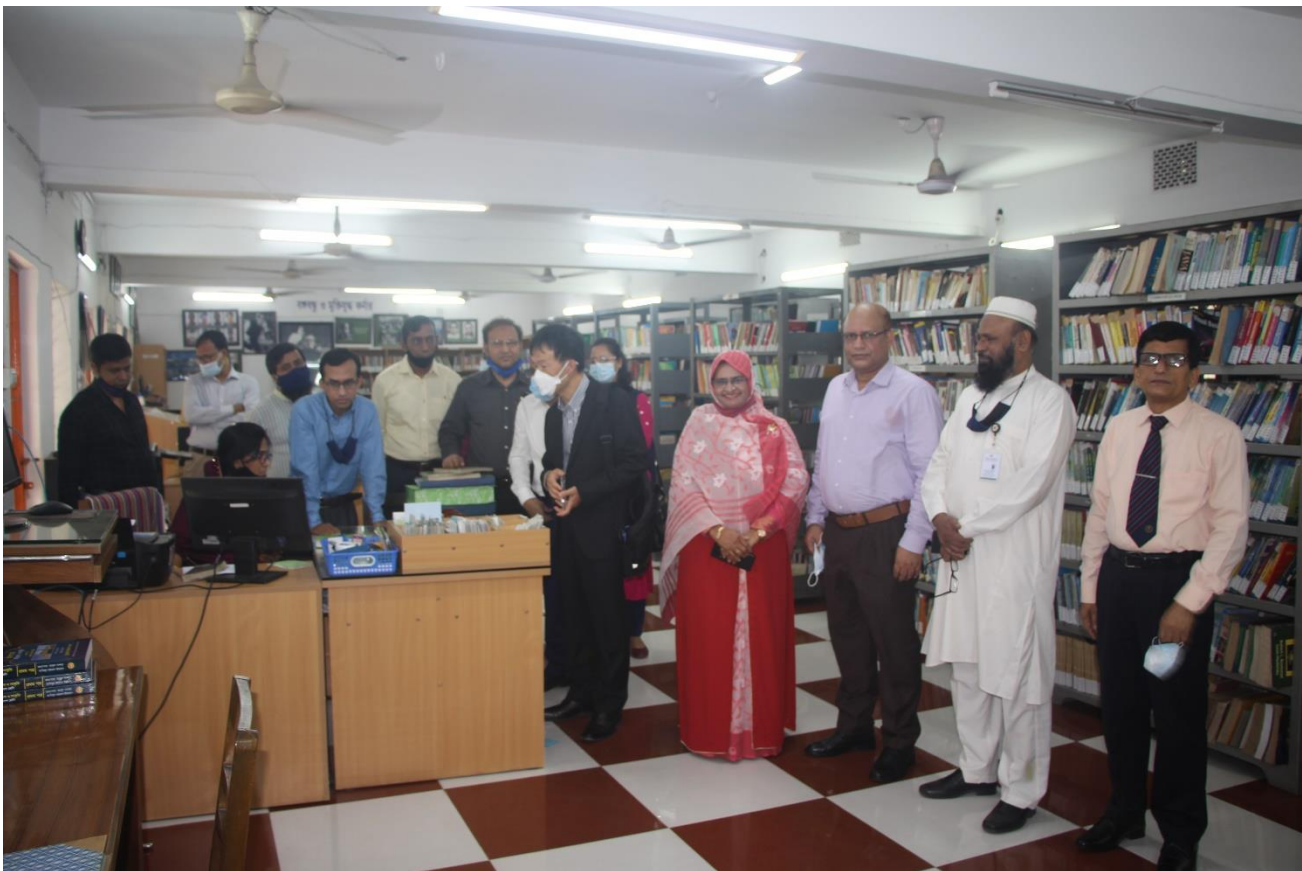
College Visit by CEDP & World Bank