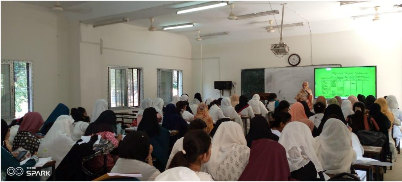
Smart Board by IDG Sub-Project