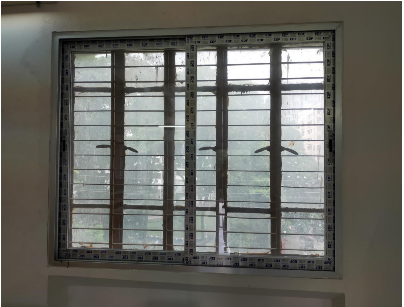
W-1 (Renovation & refurbishment Work) by IDG Sub-Project