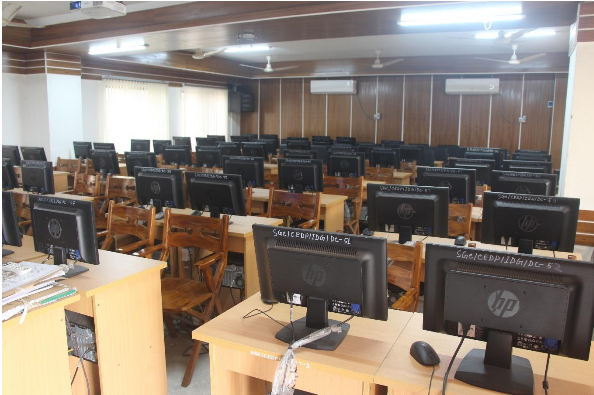
ICT Lab Installation with AC & Interior Works by IDG Sub-Project