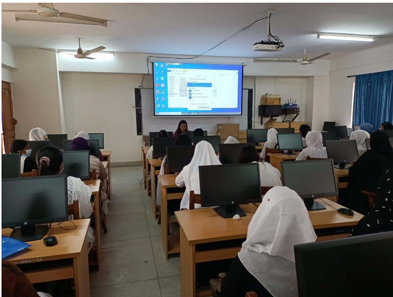
Projector in ICT Lab by IDG Sub-Project