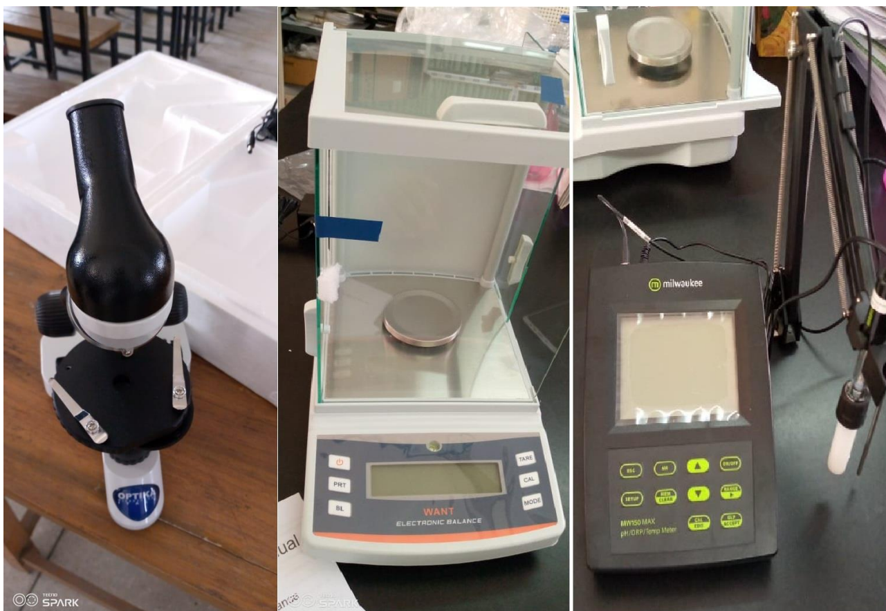
Lab Equipment by IDG Sub-Project