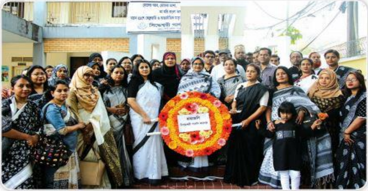
কলেজ প্রাঙ্গণে মহান ২১ ফেব্রুয়ারি ও আন্তর্জাতিক মাতৃভাষা দিবসে শ্রদ্ধাঞ্জলি জ্ঞাপন