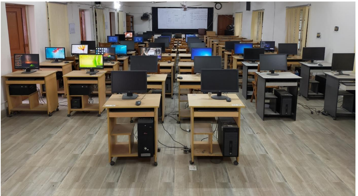
Computer Lab by IDG Sub-Project