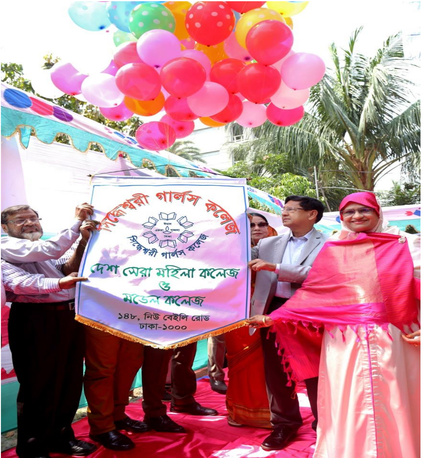
Observing college success