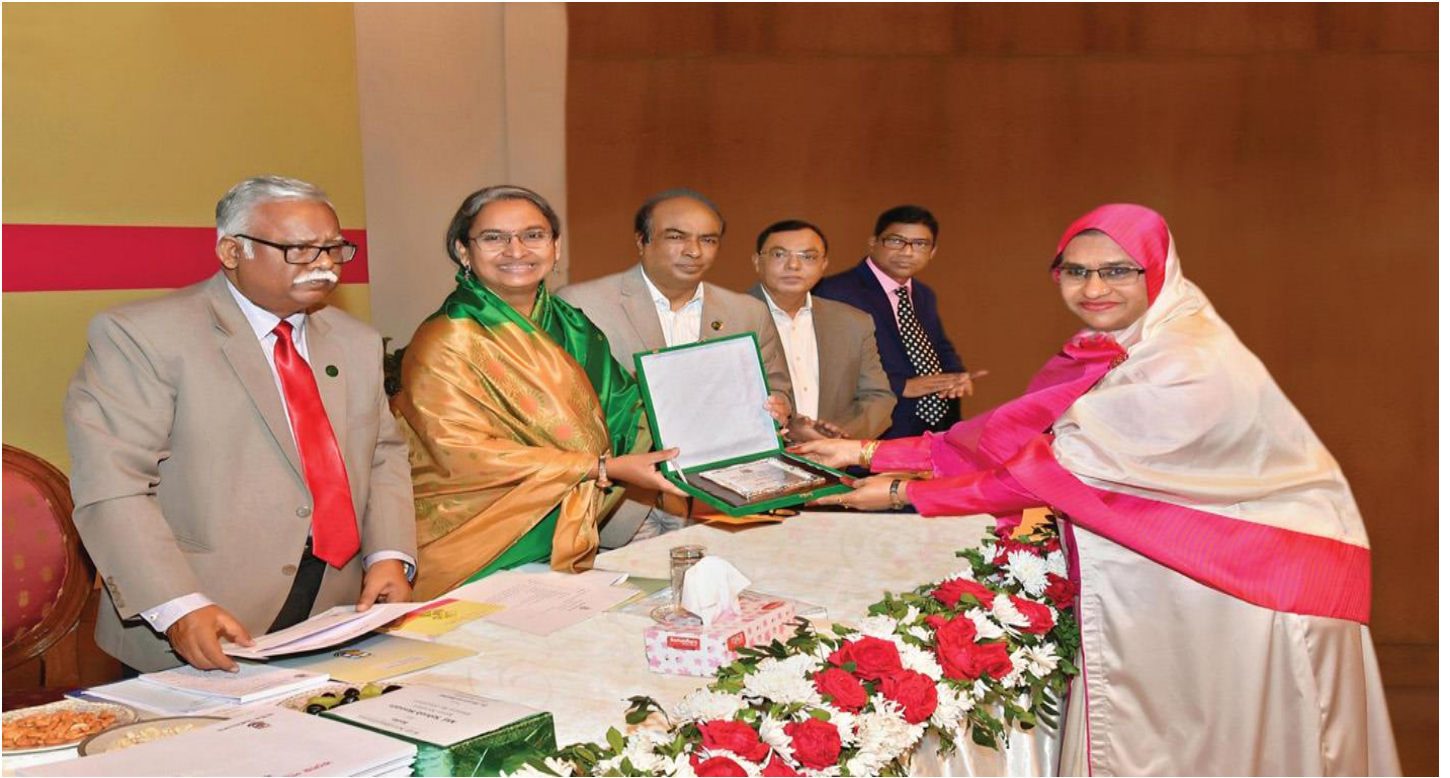
Receiving Best Women College Award-2017 from Honorable Minister Dipu Moni MP