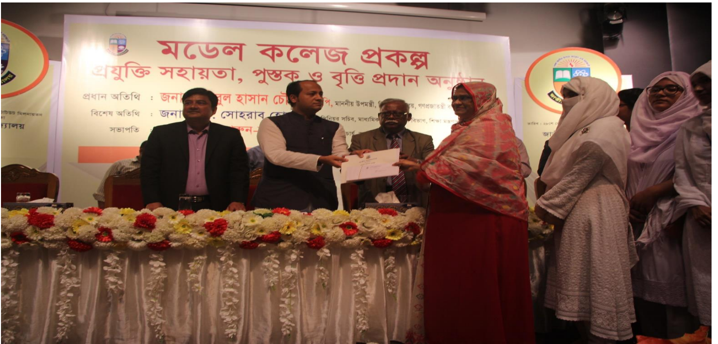
Scholarship Giving Program