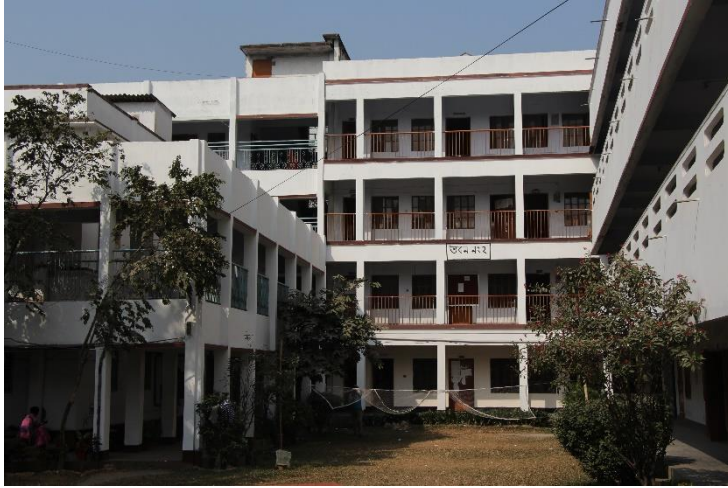
Academic Buildings 2 & 3