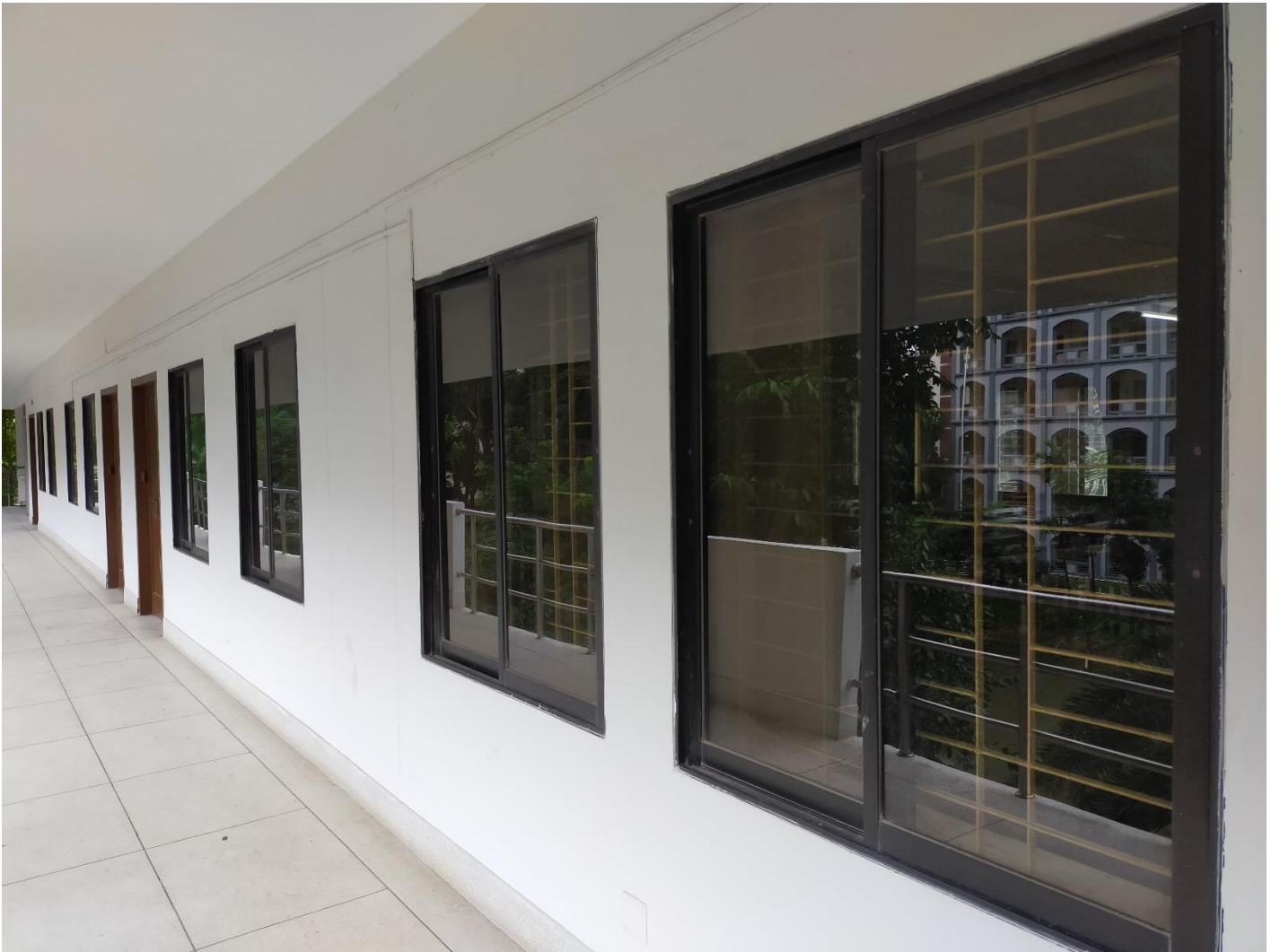
W-1 (Renovation & refurbishment Work) by IDG Sub-Project