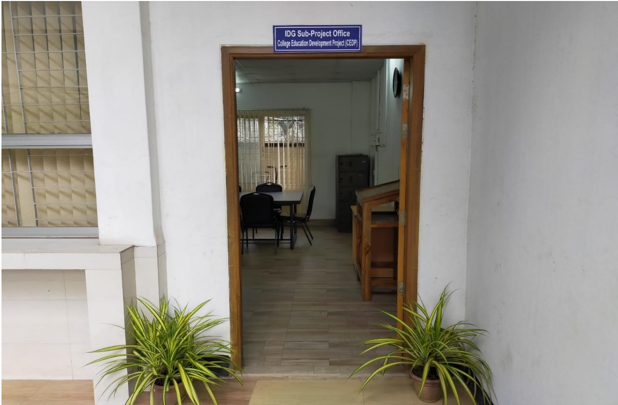
IDG Sub-Project Office