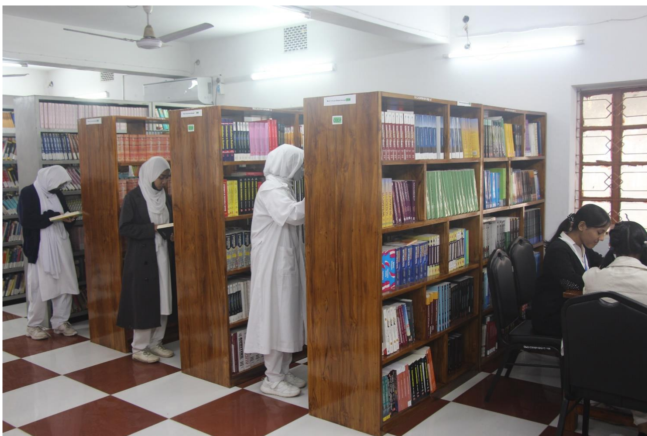
Books & Books self in College Library by IDG Sub-Project