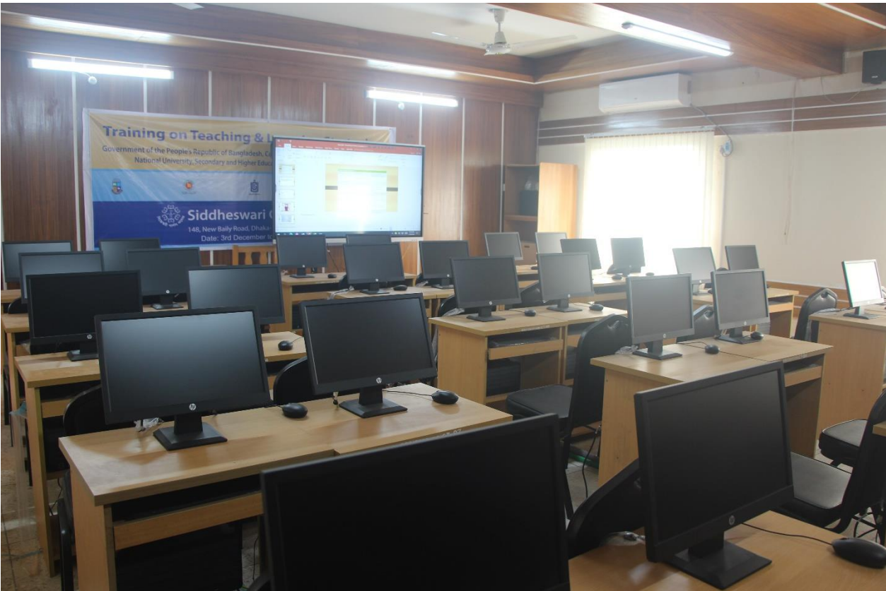
ICT Lab Installation with AC & Interior Works by IDG Sub-Project