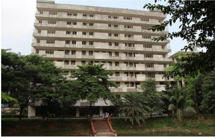
Academic Building 10