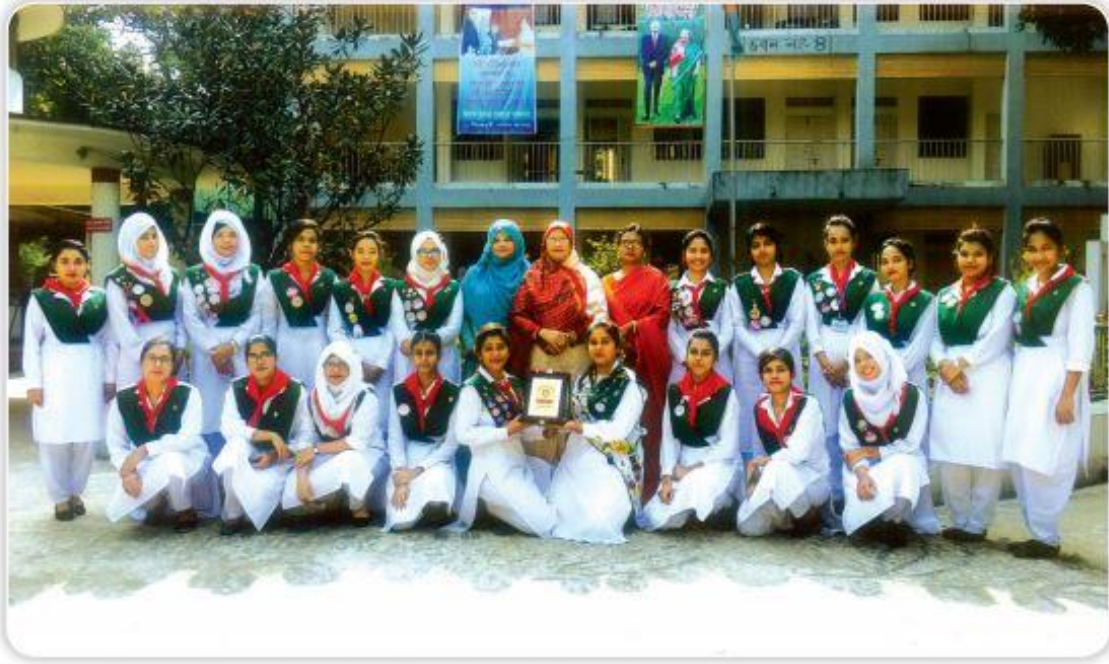
শ্রেষ্ঠ রেঞ্জার ইউনিট পুরস্কারপ্রাপ্ত সিদ্ধেশ্বরী গার্লস কলেজের রেঞ্জারবৃন্দ