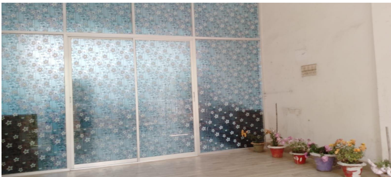
Mother Care Corner outside by IDG Sub-Project