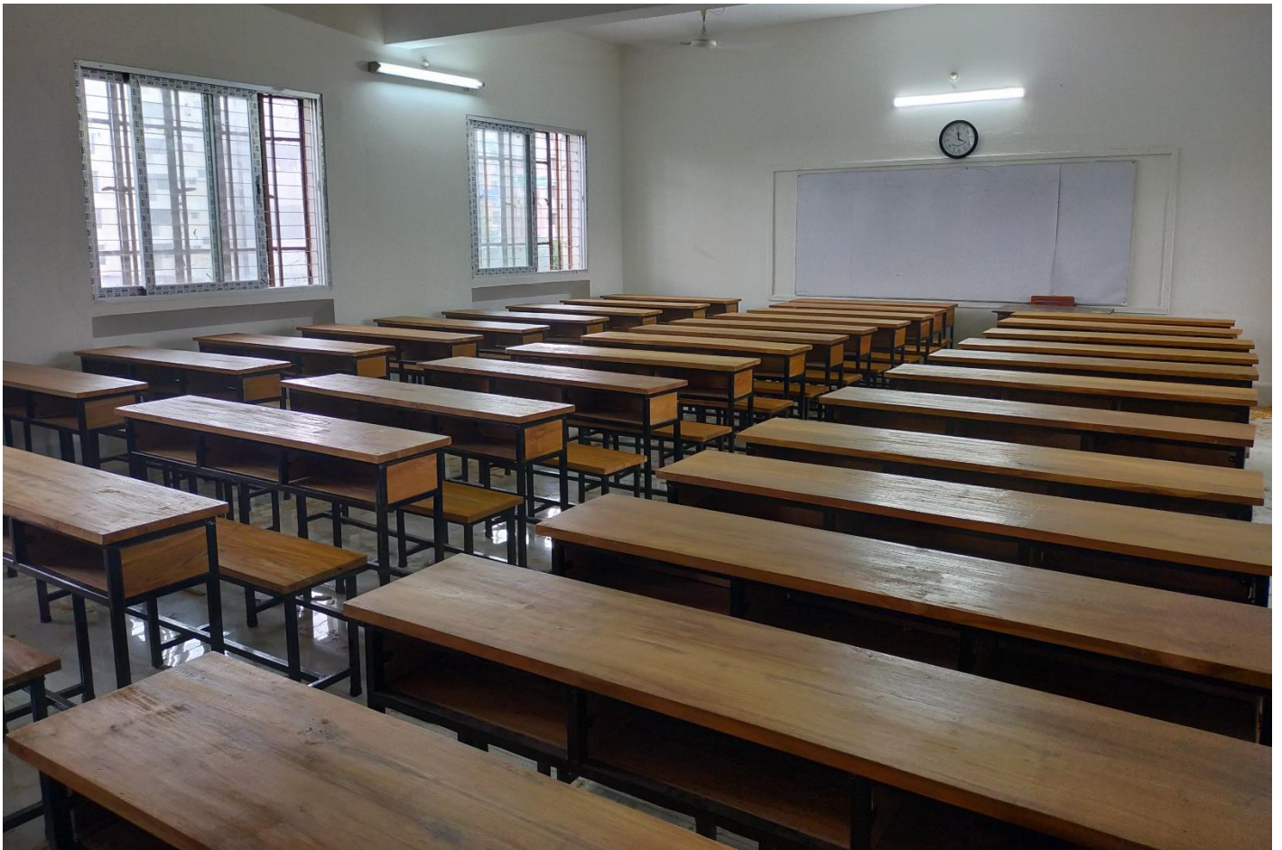
G-4 (High Bench & Low Bench) by IDG Sub-Project