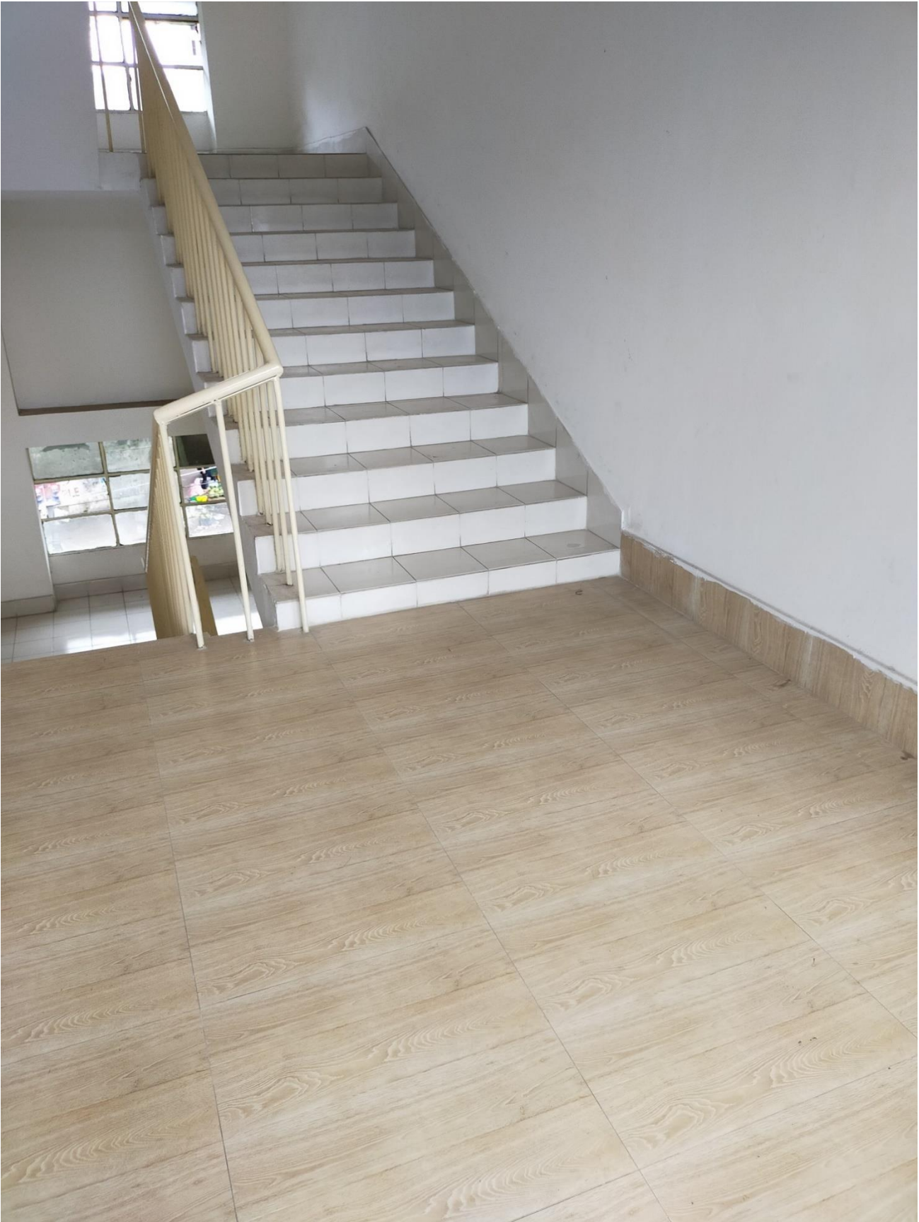
W-1 (Renovation & refurbishment Work) by IDG Sub-Project