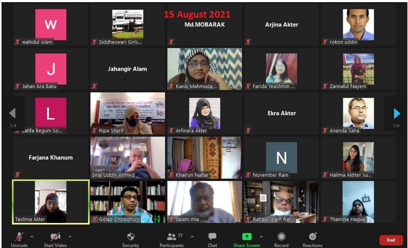
Observing 15 th August-2021