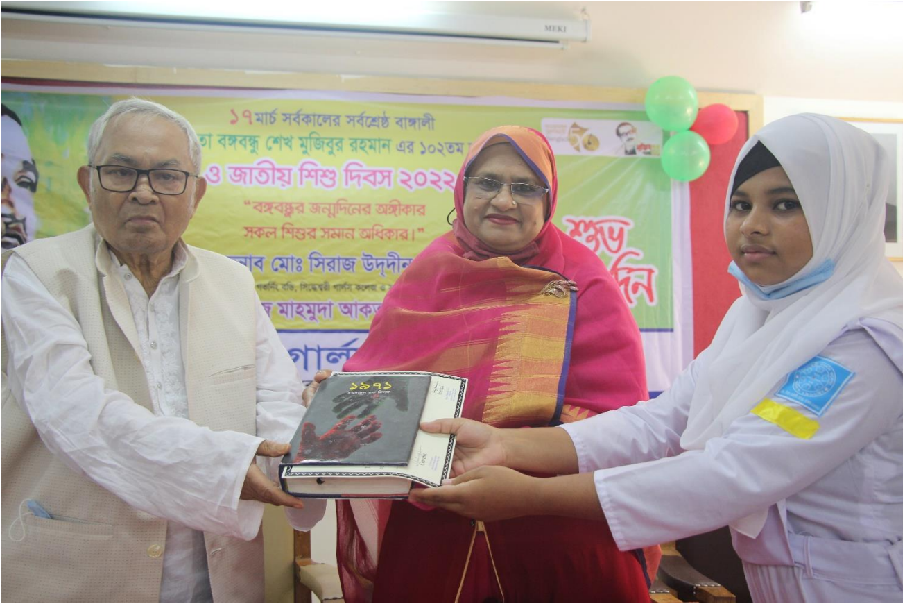
17 th March 2022