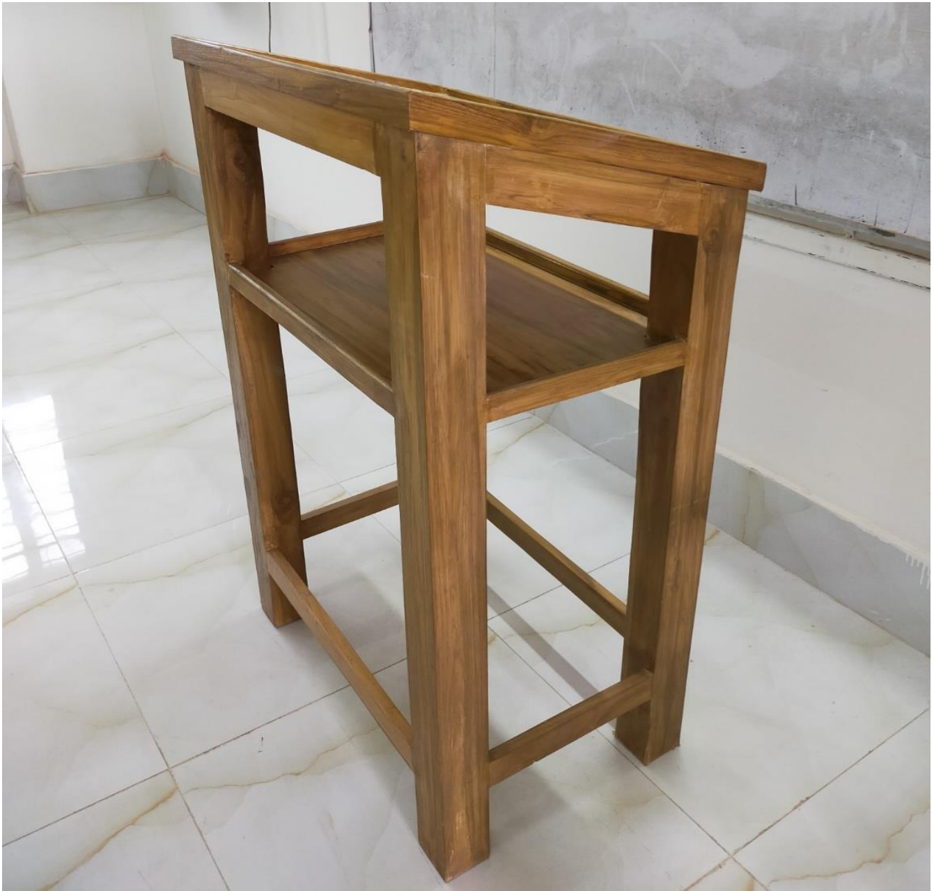
G-4 (Teachers Dais) by IDG Sub-Project