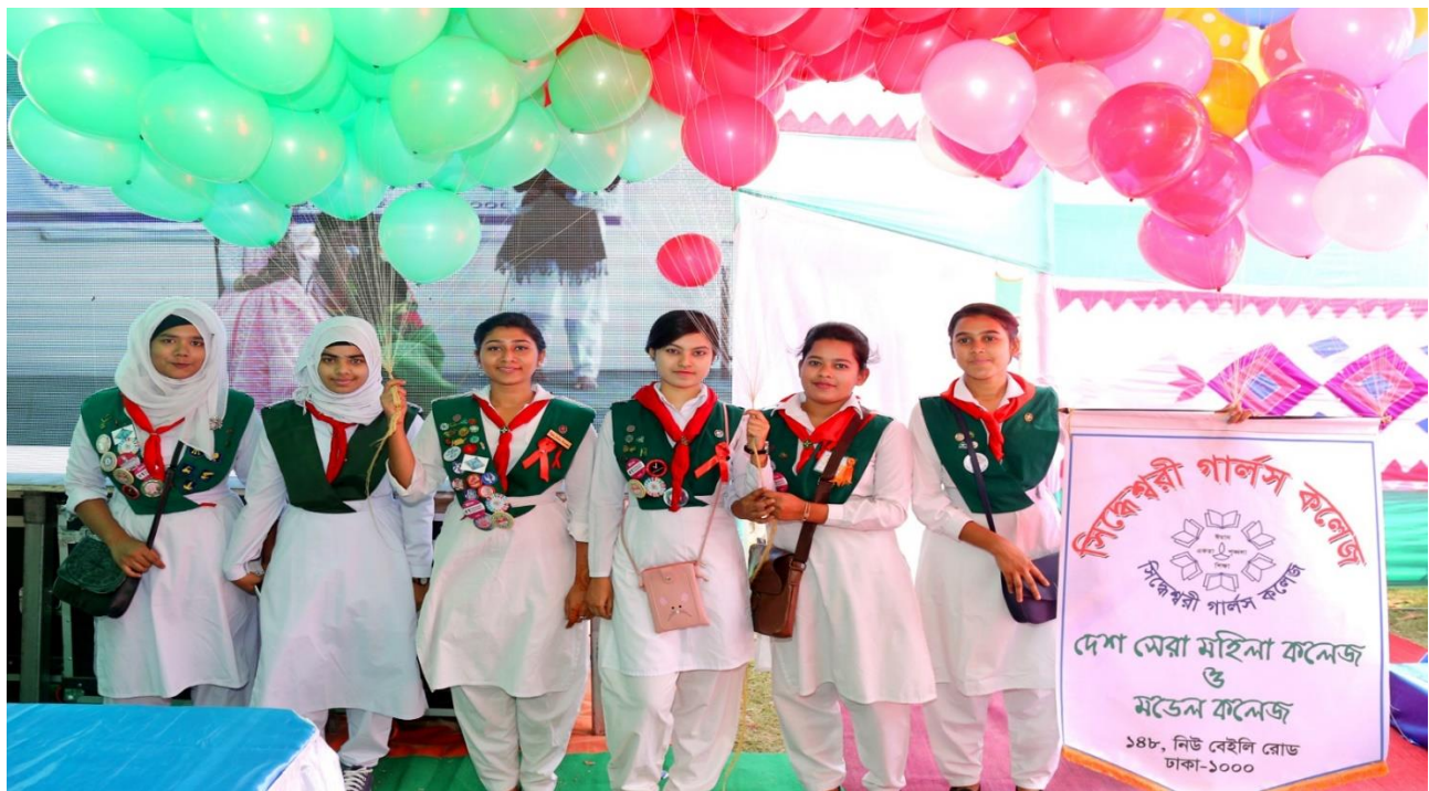
Observing college success