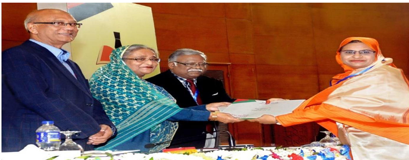
Receiving Best Women College Award-2016 from Honorable Prime Minister Sheikh Hasina