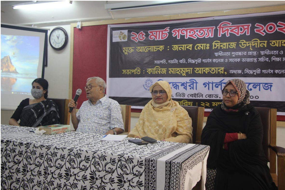
25 th March 2022