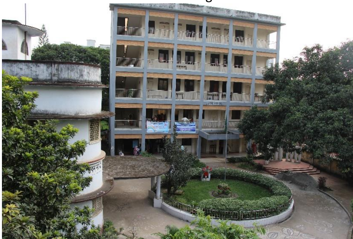
Academic Building 4