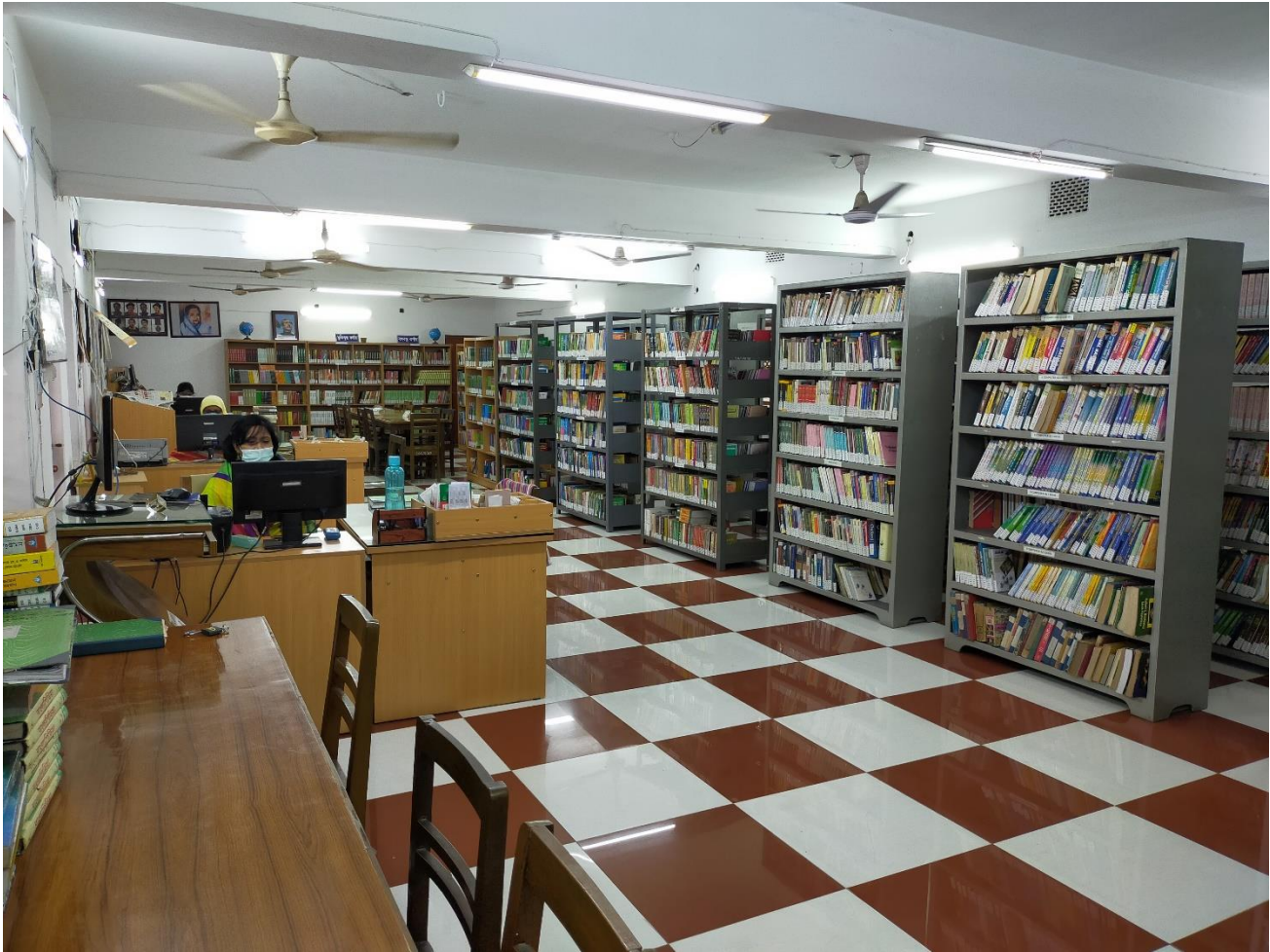
Books in College Library by IDG Sub-Project